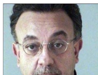
Depositions sought in DaSilva