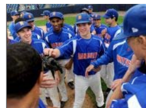
Danbury advances to final