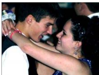
A night to remember for New Milford High School seniors

electrifying the world with his fine art images of nature and personal portraiture created in his Woodbury studio.