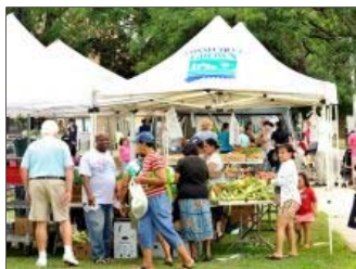
Farmers market set to open next week at Danbury Fair mall