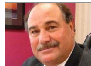
$115 million budget approved